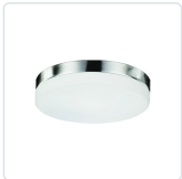
FM2009-BN Brushed Nickel